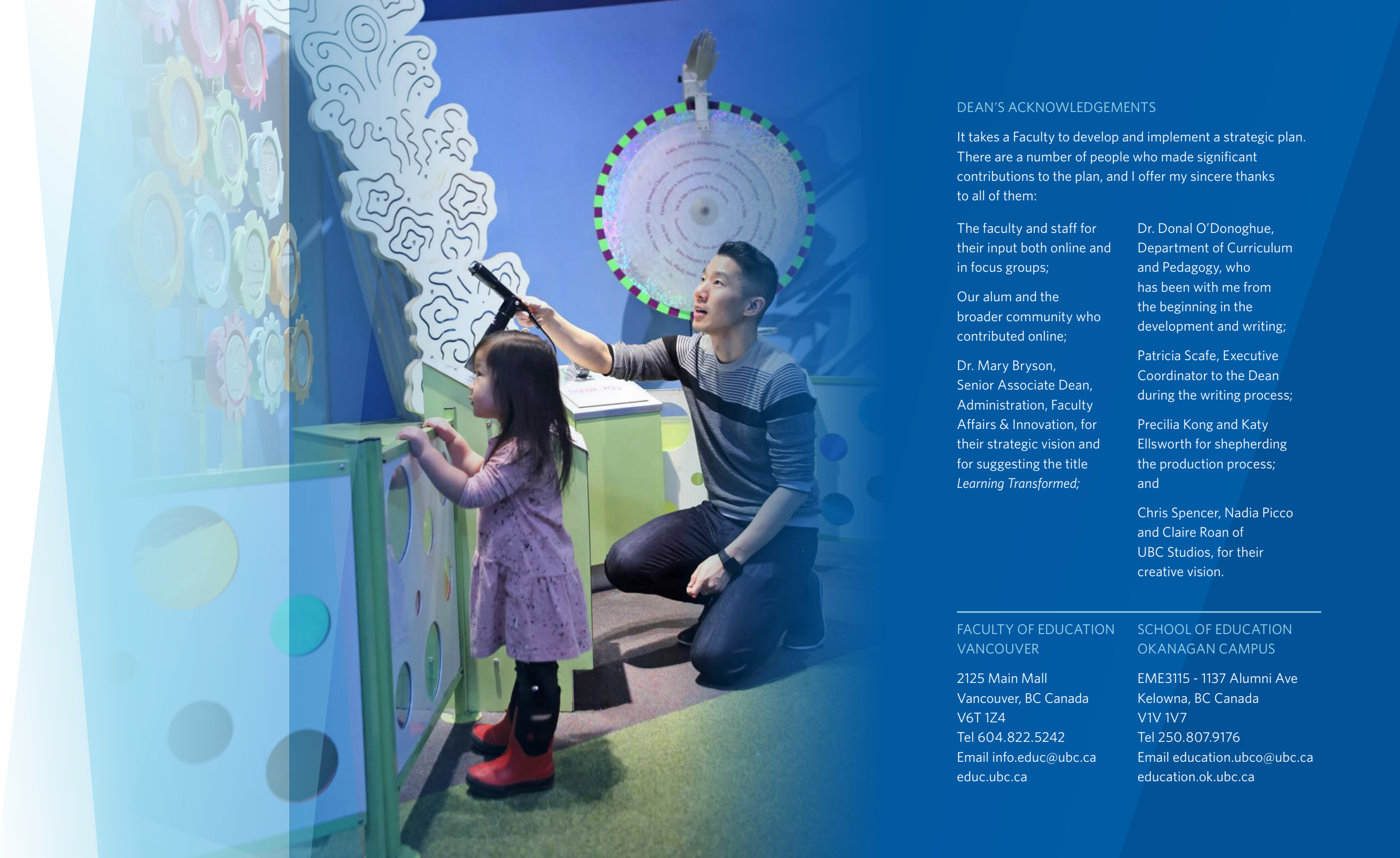
Alumni and families at Telus World of Science