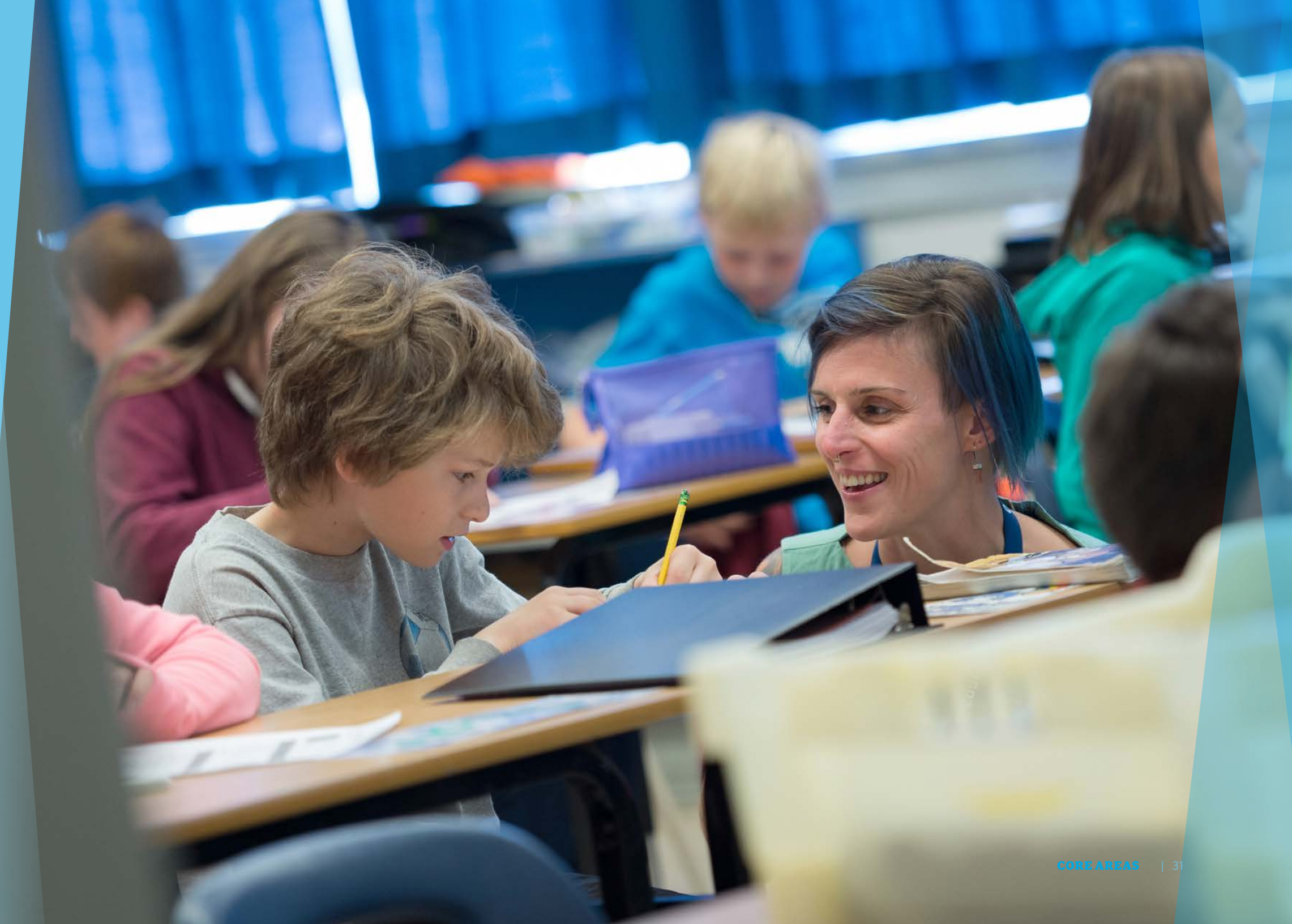
Teacher candidate on practicum placement, Okanagan School of Education

of short-duration programs that enable international students to experience study at UBC through the Vancouver Summer Program as well as opportunities for guest learners in collaboration with their home universities, boards of education, and local and national governments. Each year, we welcome hundreds of participants in such programs, including international undergraduate and graduate students, practicing teachers, university faculty, and academic leaders. Our focus has been on expanding international communities of academics dedicated to transformative, impactful teaching and learning through the provision of programs that focus on evidence-based, research-informed improvement in educational practice.