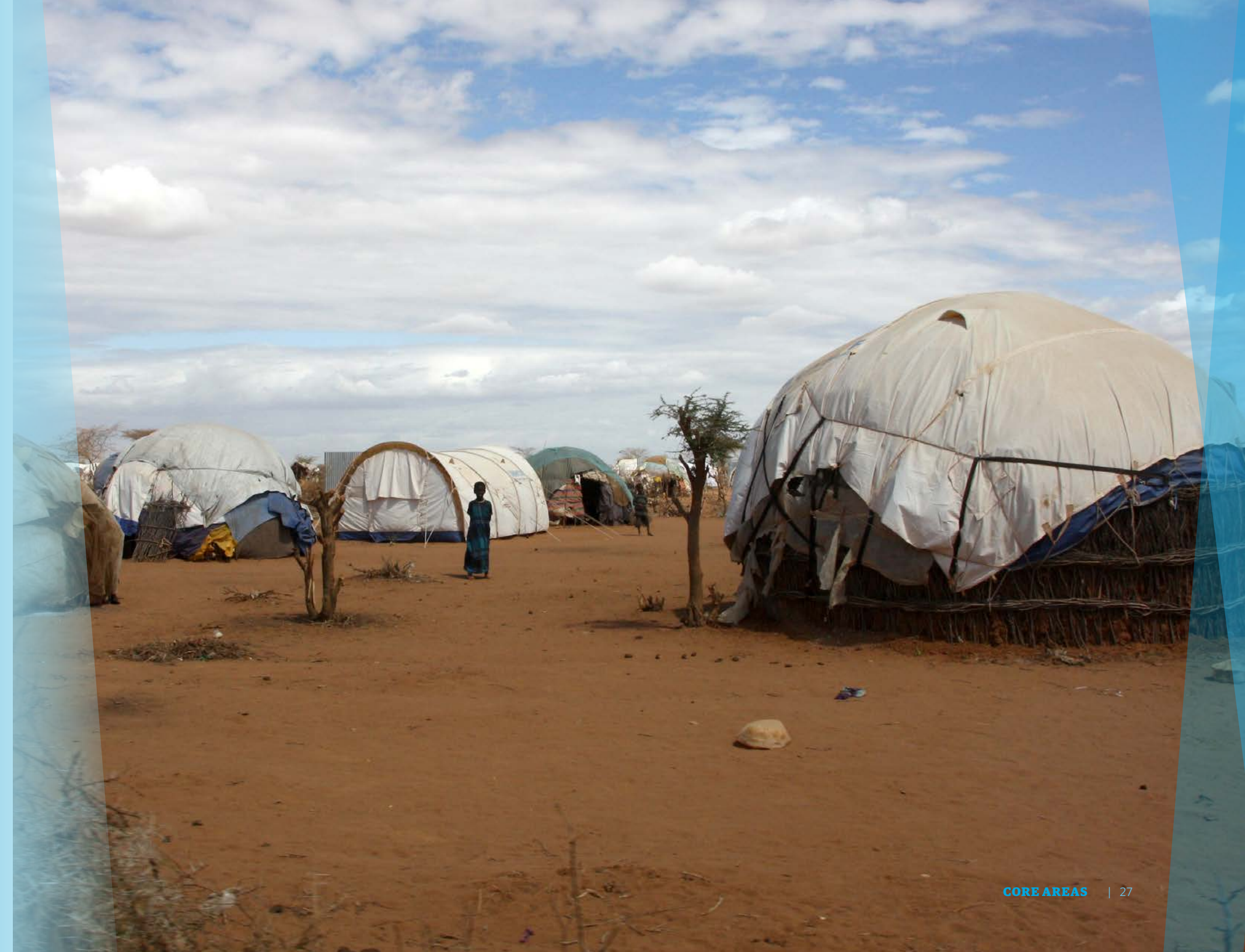
Refugee shelters in the Dadaab camp, Kenya

The Faculty of Education is known locally and globally for its research-intensive approach to teaching and learning. In addition to disciplinary expertise across all areas of curriculum and pedagogy, language and literacy, educational studies, kinesiology, and counselling psychology and special education, the Faculty offers uniquely outstanding programming in multi- and interdisciplinary areas such as rural education, Indigenous education, International Baccalaureate education, early childhood education, inclusive education, and learning technologies, to name a few. The Faculty is also a leader in developing curriculum and rich learning experiences that align with key educational priorities, such as mental health literacy, social and emotional learning, educational leadership, teaching for sustainability, and multiliteracies education, among many others.