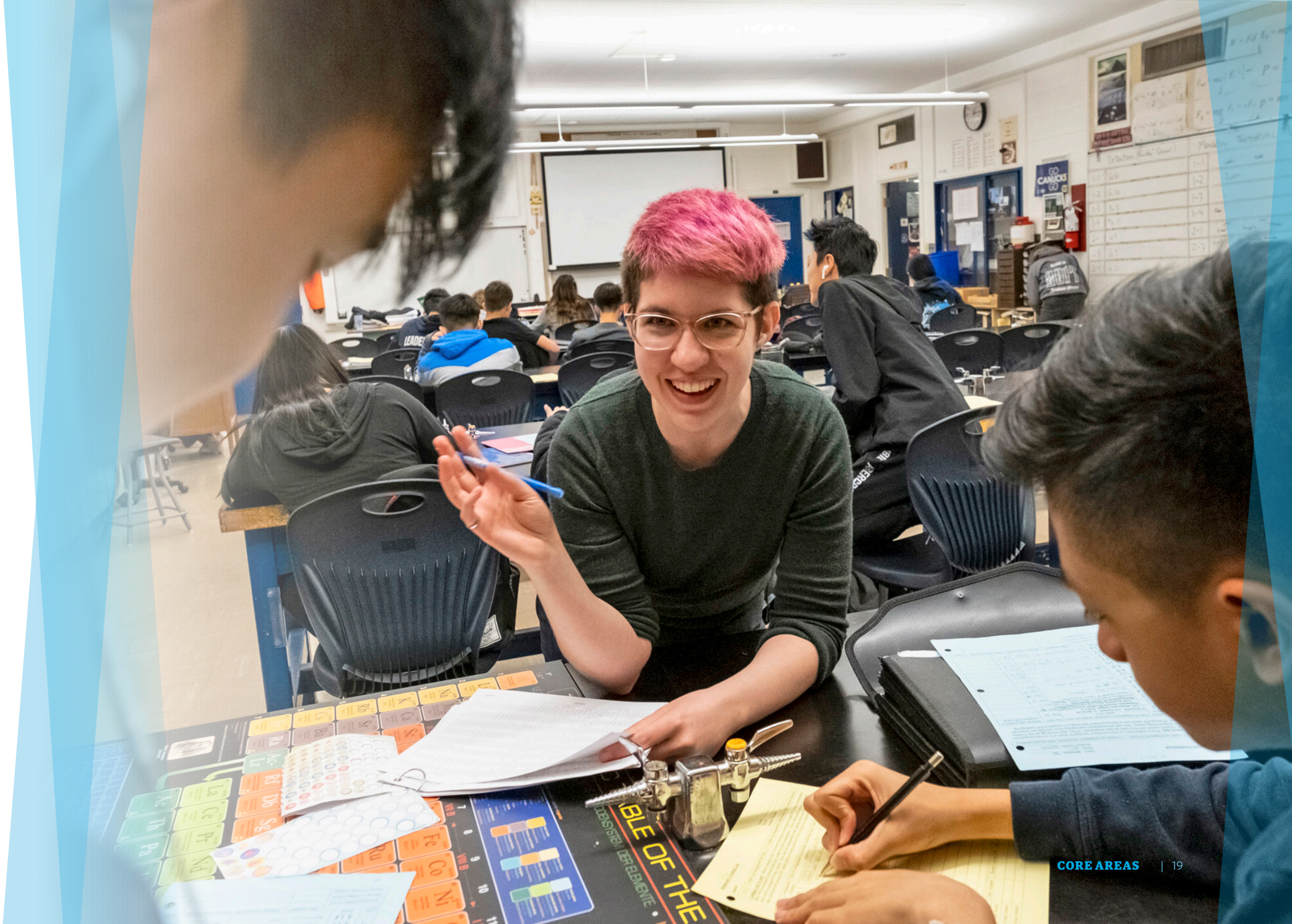
Teacher candidate on practicum, UBC Vancouver

In pursuit of these values, we recognize the significance of place. The work of our Faculty occurs on local, ancestral and unceded territories that include the Musqueam and Okanagan Nations, and our students, staff, and faculty benefit from the knowledges, languages, and peoples situated on these lands. Since our relationships extend beyond the physical campus, reaching provincial, national, and international Indigenous communities, we must also work in collaboration with these communities to advance Indigenous interests. To engage Indigenous learners and communities in education and research, we must address systemic barriers by opening access, revising curricula, and expanding employment opportunities.